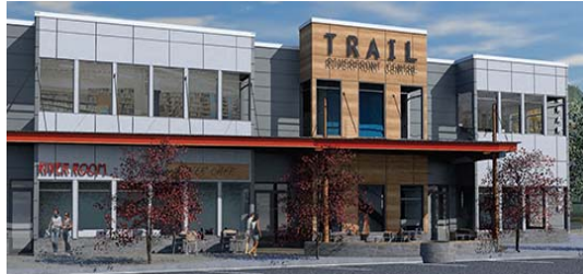
Concept drawing for the Riverfront Centre