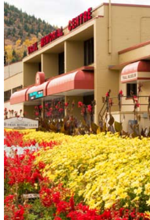
The current Trail Museum, open once again for the summer season thanks to the Canada Summer Jobs Program.

The LeRoi Foundation provided a grant for the purchase of a new laptop, which was very much needed. We were also successful in obtaining a $1500 grant through the BC Arts Council, $4000 through the BC Gaming Branch, and